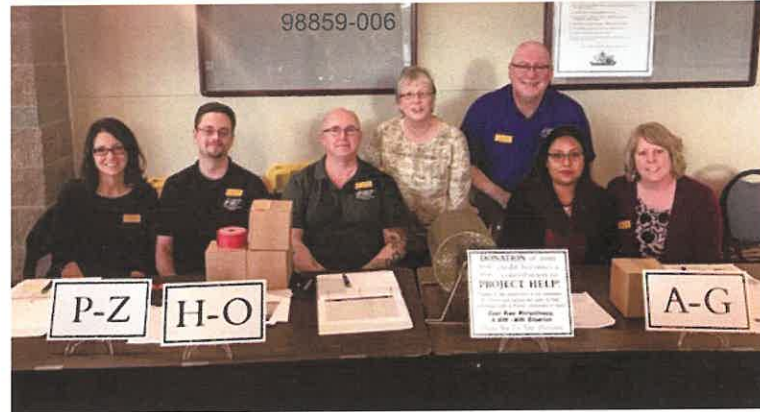
Lakeview Light & Power staff welcome members to the 96th Annual Membership Meeting on March 20 at the Lakewood City Hall Council Chambers. In addition to reports, members were treated to door prizes and refreshments. 99960-001